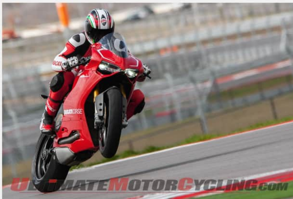
Ducati 1199 Panigale R