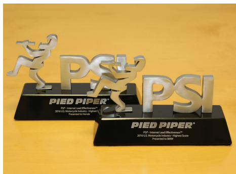
Pied Piper conducted the industry's first internet leads study, and found BMW and Honda dealers at the top.