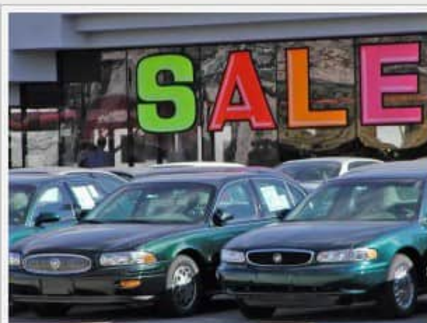
It takes more than a good deal to win over a potential customer, reveals a new study.

That's a key finding of the Prospect Satisfaction Index, an annual study by the California research firm, Pied Piper. It reveals that Mercedes-Benz dealerships ranked highest in the newly released 2009 PSI, which looks at hidden facets of sales process, and how lookers are converted into serious prospects.